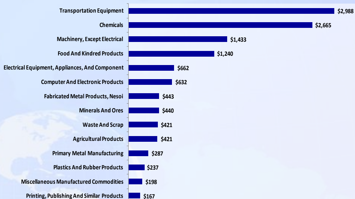
Missouri's Top Fourteen Exports in 2010 (Millions)

Fourteen Missouri industries each topped $160 million in export sales in 2010. They include transportation equipment ($3.0 billion), chemicals ($2.7 billion), machinery ($1.4 billion), food and kindred products ($1.2 billion), electrical equipment ($662 million), computer and electronic products ($632 million), fabricated metal products ($443 million), minerals and ores ($440 million), waste and scrap ($421 million), agricultural products ($421 million), primary metal manufacturing ($287 million), plastic and rubber ($237 million) miscellaneous manufactured commodities ($198 million), and printing, publishing and similar products ($167 million).