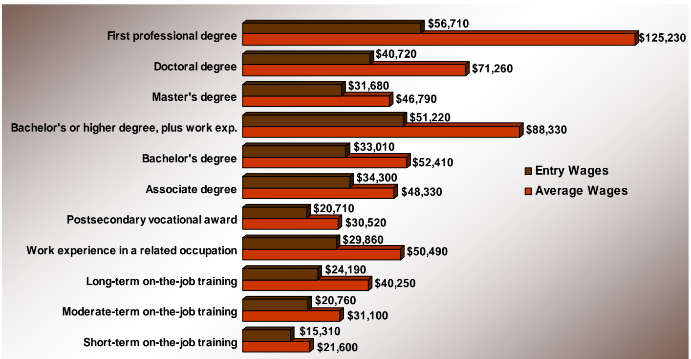
Annual Wages 2006

Occupations in the following three education levels will experience the greatest increase in earnings from entry wages to average wages: first professional degree (+$68,520), Bachelor's or higher degree plus work experience (+$37,110) and Doctoral degree (+$30,540).